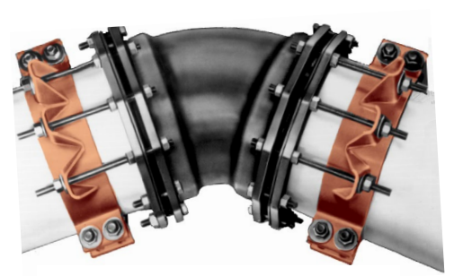
JCM 610 Fitting Restrainers