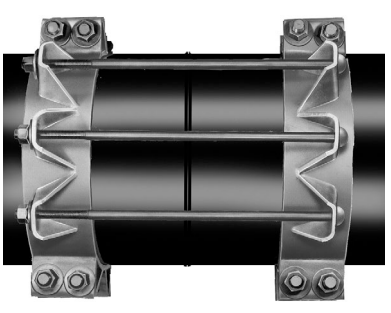
JCM 621 Joint Restrainers – HDPE