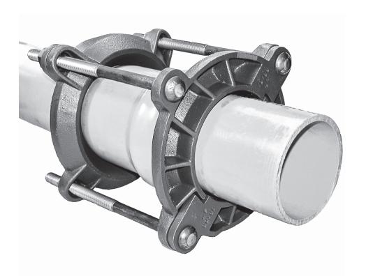
JCM 143 - 4" - 12"

JCM 143 Bell Joint Leak Clamp 14" and Larger - fabricated steel. Standard Ductile Iron sizes listed. Optional oversize or undersized Cast Iron pipe O.D.s available. Large sizes available. Contact JCM Sales Team.