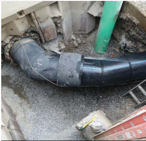
This application challenged JCM with a leaking electro fusion coupling on 22" HDPE Pipe, JCM submitted the 114 Mechanical Joint Bell Repair Sleeve style sleeve to make the repair.