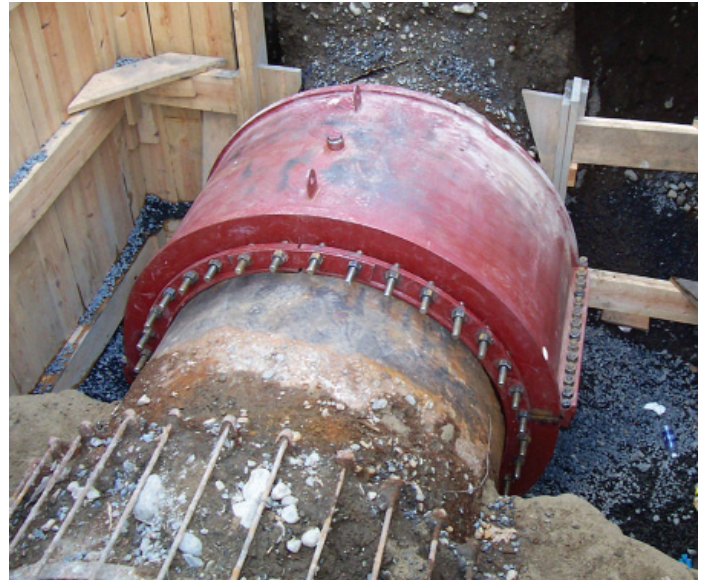
JCM 114 Mechanical Joint Bell Repair Sleeve

JCM Series 114 Mechanical Joint Repair Sleeves are ideal for situations that involve damaged pipelines or leaking pipeline appurtenances. The JCM 114 Series is a unique and versatile fitting that lends itself to be the permanent solution to complicated issues. The JCM 114 Series offers: