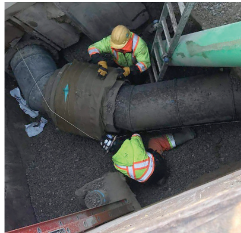
At the completion of the installation, technicians add to the corrosion resistance of the epoxy coated fitting by wrapping the entire unit in additional protective material.

JCM provided this fitting to the job site in less than 48 hours after receiving the order.