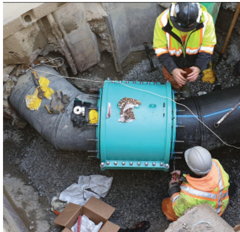
Above, the mechanical joint followers are installed on the left side of the fitting and technicians finish up the installation by installing and tightening the mechanical joint follower bolts on the right side.