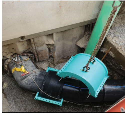
Shown above, the 114 Bell Repair design has an expanded middle section that accommodates the outside diameter and laying length of the coupling with end flanges that transition down to fit on the outside diameter of the pipe. As a mechanical joint fitting, the 114 has both sidebar gaskets and end gaskets that provide the watertight seal around the leaking coupling.