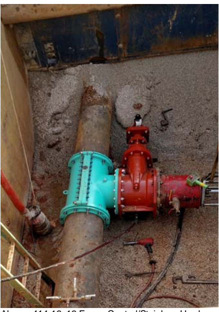
Above: 414-16x16 Epoxy Coated/Stainless Hardware