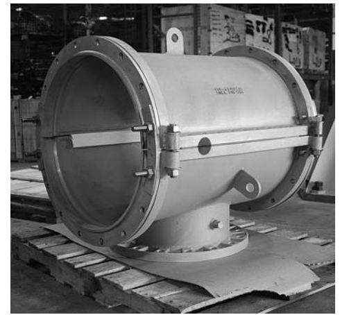
Above: 6414-24x16 All 316 Stainless Steel

The JCM 414 Fabricated Mechanical Joint Tapping Sleeve is recommended for taps on pipe that will not accommodate a direct top seal tapping sleeve. The 414 utilizes a true mechanical joint sleeve design that completely encompasses the tap area, eliminating any potential leaks due to pipe cracks or breaks. Side gaskets are internally and externally trapped in a recessed groove machined into the bolting lug bars that completely compress the gaskets creating the watertight seal on the sleeve. The end gaskets are compressed into the sleeve housing with mechanical joint end glands, providing the water tight seal on the ends of the sleeve and completing the full encapsulation of the tap area.