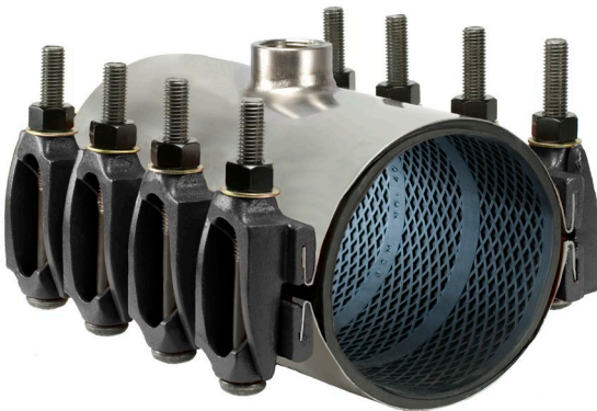
JCM 174 Tapped Multi Band Universal Clamp Coupling Image reflects 12" width

JCM 100 Series Universal Clamp Couplings meet or exceed ANSI/AWWA C230 Standard for Stainless – Steel Full-Encirclement Repair and Service Connection Clamps as applicable.