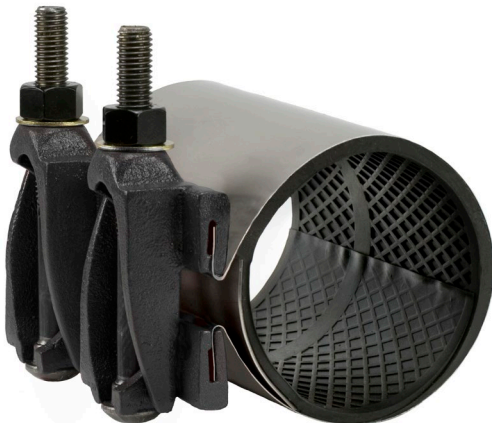
JCM 171 Universal Clamp Coupling Image reflects 6" width

JCM 100 Series Universal Clamp Couplings meet or exceed ANSI/AWWA C230 Standard for Stainless – Steel Full-Encirclement Repair and Service Connection Clamps as applicable.