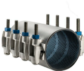
JCM 132 All Stainless Steel Universal Clamp Coupling Image reflects 12" width

JCM 100 Series Universal Clamp Couplings meet or exceed ANSI/AWWA C230 Standard for Stainless –Steel Full-Encirclement Repair and Service Connection Clamps as applicable.